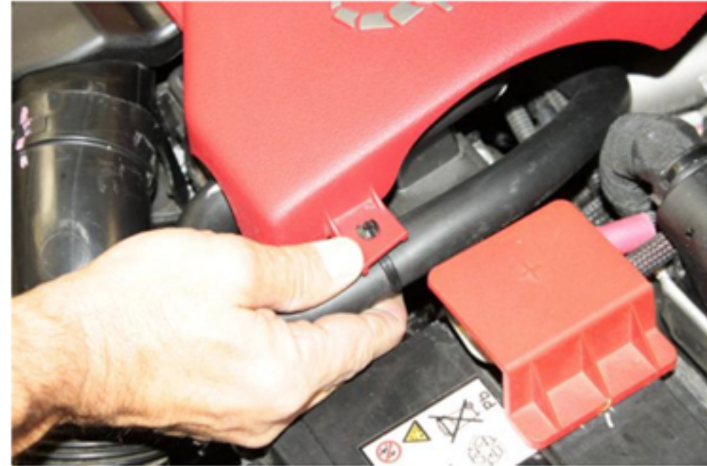
17. Re-attach breather hose support to air box lid.