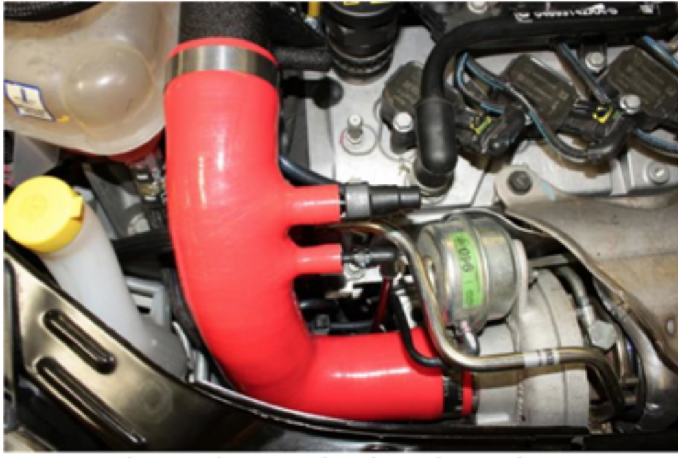
9. Attach vent lines and tighten hose clamps.