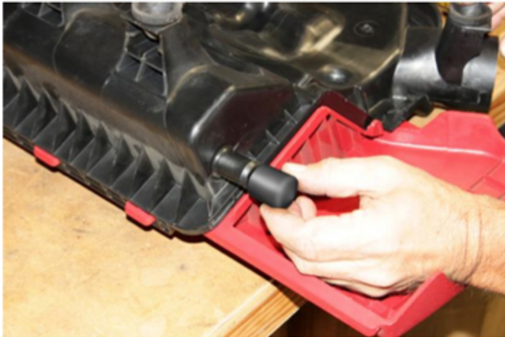
12. Cap port on air filter box using supplied vinyl cap.