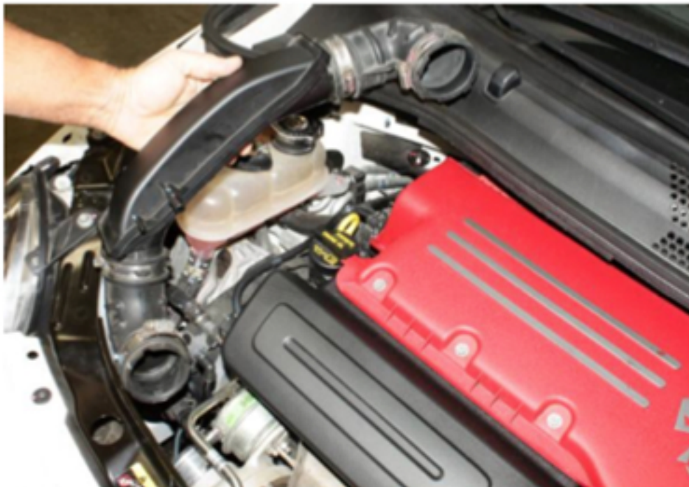
2. Loosen hose clamps at turbo and air filter box then remove turbo inlet pipe.