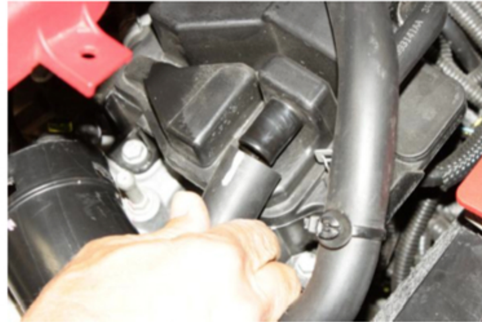
5. Disconnect valve cover breather hose.