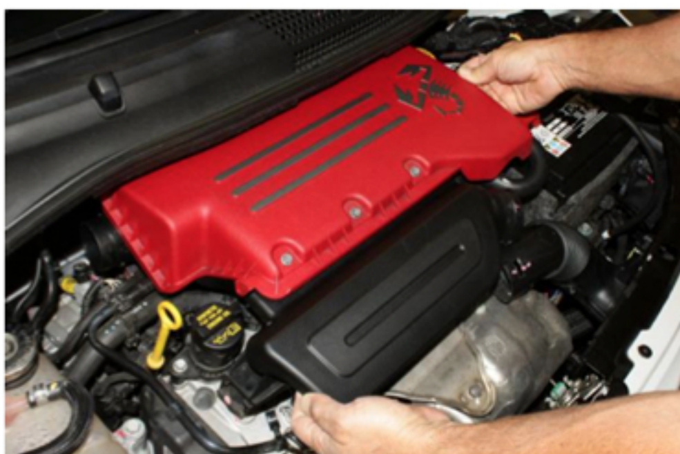
4. Lift air filter box off rubber mounts to remove.