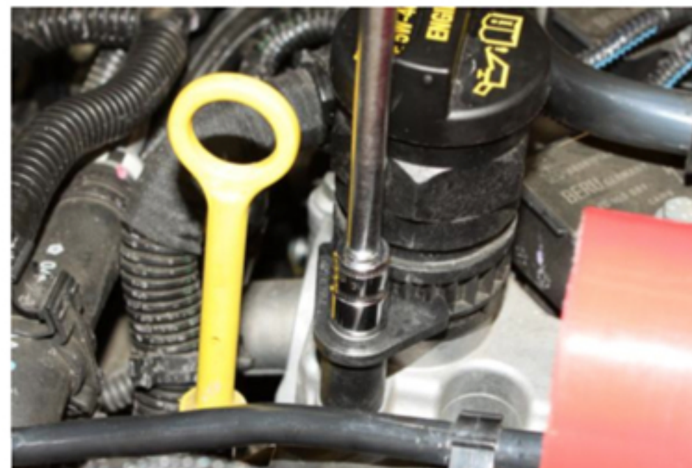
7. Using 10 mm socket, unbolt oil filler support bracket.