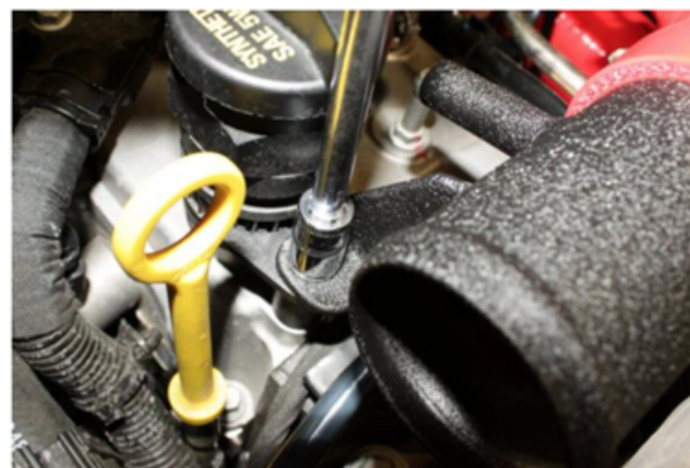
8. Install hose clamp onto silicone hose, insert supplied intake pipe into hose then mount on top of oil filler support bracket using supplied M10x40mm bolt.