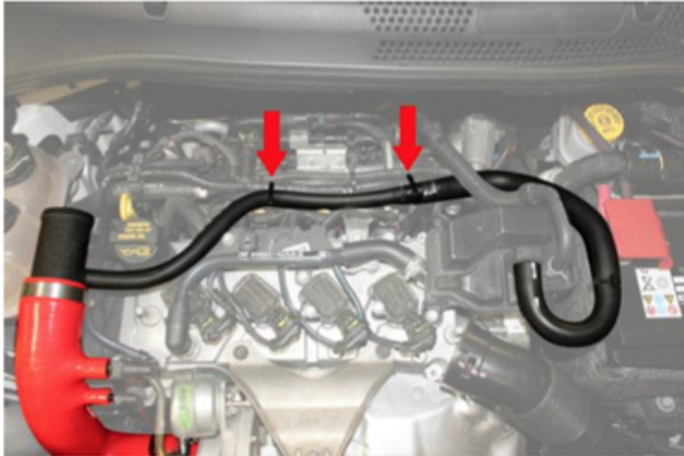
11. Route vent hose as pictured and wire tie to hard plastic vent line as pictured.