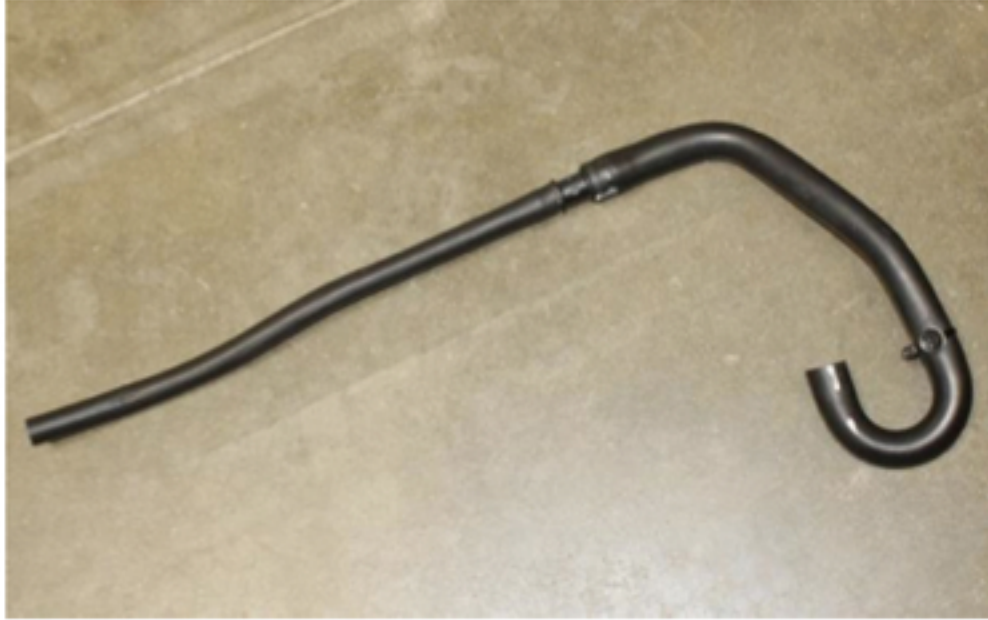
10. Attach supplied plastic union and 1/2" hose to original valve cover breather hose from air filter box.