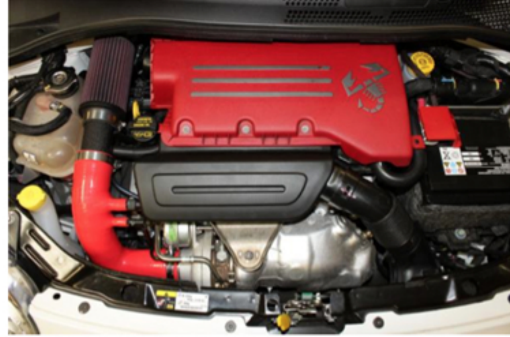
16. Install NEUF filter and original air filter box lid.