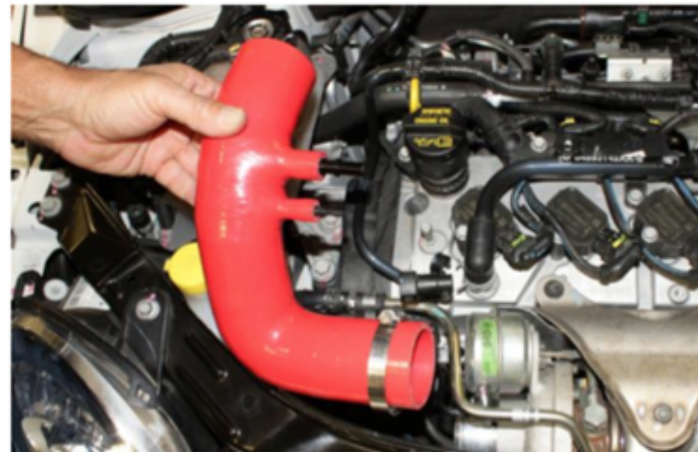
6. Install the (2) vent line fittings and hose clamp onto silicone hose then attach to turbo.