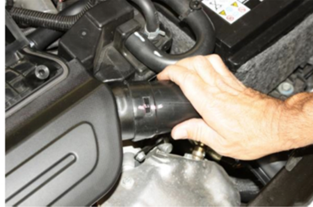
15. Connect front air intake duct.