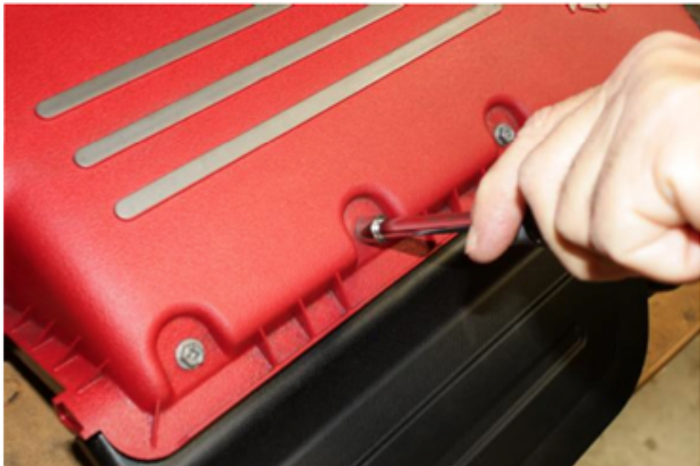
13. Unscrew air filter lid and remove filter.