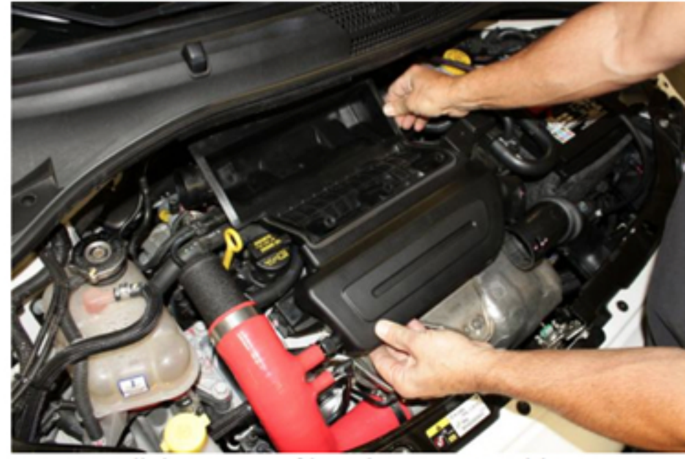
14. Install lower air filter box onto rubber mounts making sure vent hose is not being pinched off.