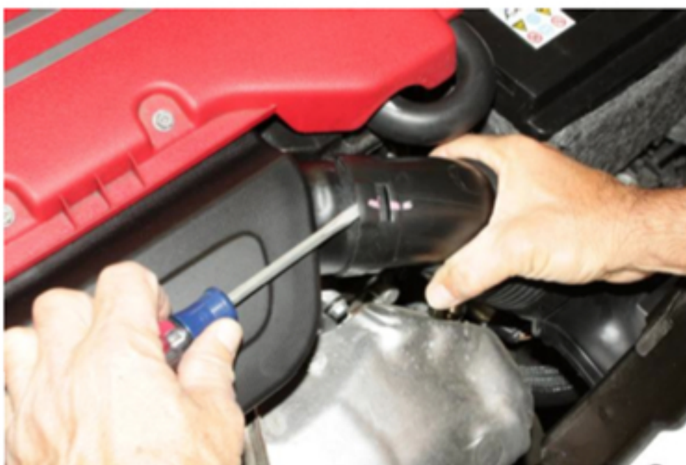
3. Using a screwdriver disconnect inlet duct from air filter box.